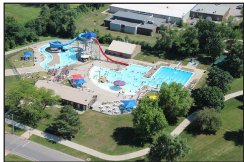
Grinnell Mutual Family Aquatic Center

We make a living by what we get, but we make a life by what we give. -WINSTON CHURCHILL