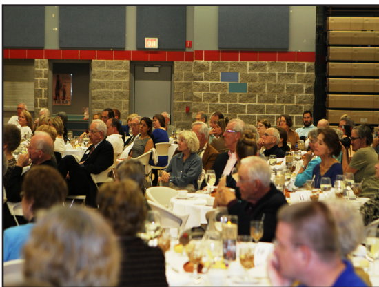
Guests at the 2013 Spirit of Giving dinner