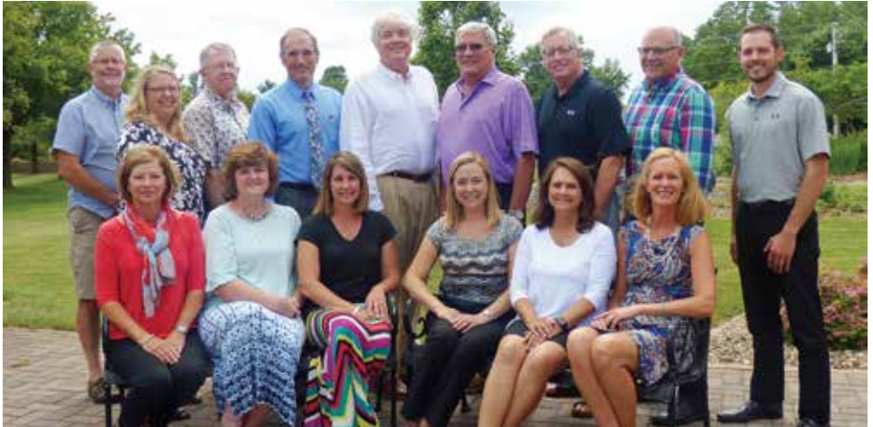
2018 Greater Poweshiek Community Foundation Board of Directors

*Honored recipient will receive a special letter announcing from whom the gift was made and the fund to which it will go. The amount of the gift will not be disclosed.