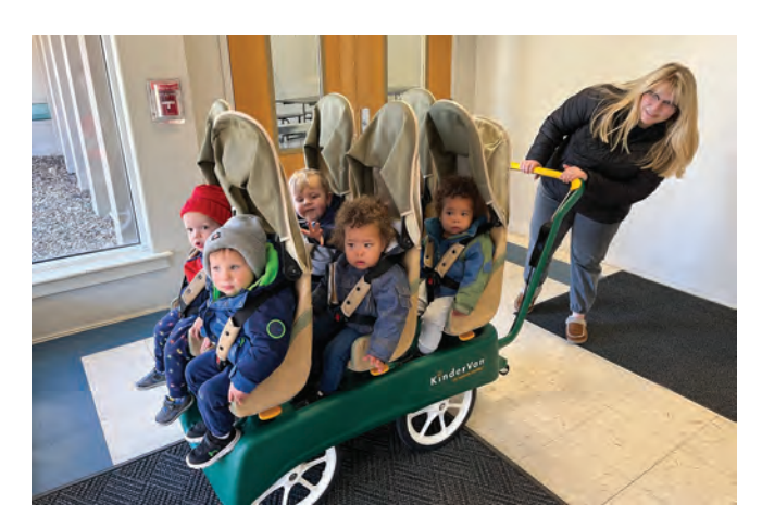
Community Fund grants support projects such as repairs in pioneer cemeteries and new, safe equipment in child care centers.