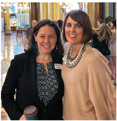
GPCF board and staff connect with legislators through these networks to inform them about the causes you care about.

Volunteer nonprofit boards are integral to the organizations they serve but it is easy to become overwhelmed by the complexity of managing a nonprofit. GPCF takes its community leadership responsibility seriously which is why we have created this (mostly serious) top ten list to help donors understand our role.