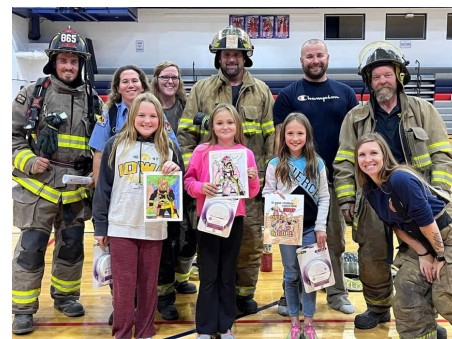
A PCA grant helped Malcom Fire Department host community education events.

Granting Dreams, Growing Futures - GPCF granted over $655,000 to local initiatives, turning dreams into reality. Investing funds in local projects ensures the roots of progress are seen in every corner of Poweshiek County.