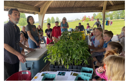
Art in the Park

Partnerships, Partnerships, Partnerships - GPCF is a trusted ally throughout Poweshiek County working with more than 50 community partners .