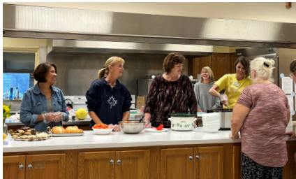
Board members & staff serving a community meal

Community Cupid Strikes Again - Just like cupid's arrows, we are connecting donors with causes they are passionate about across Poweshiek County and beyond.